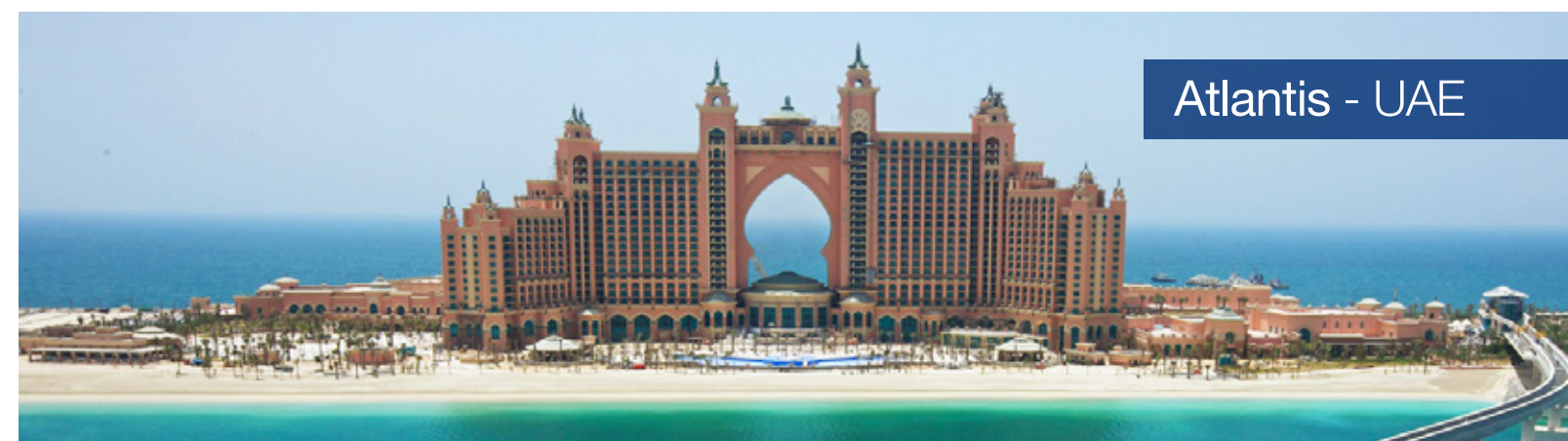
Atlantis - UAE

Our products have been used on a number of high-profile and prestigious projects across the world: