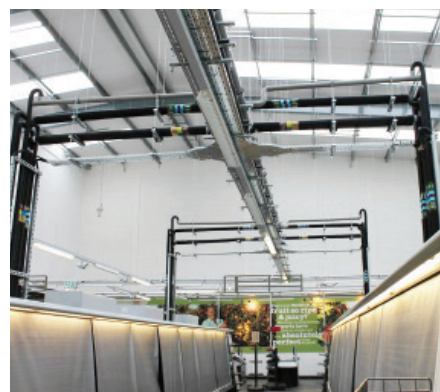
Food / Humid Environments