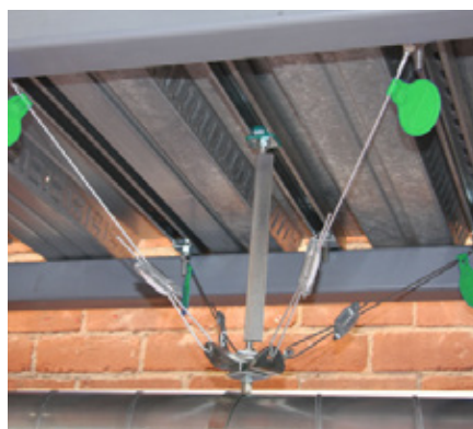
Seismic and Anti-Terrorism/ Force Protection