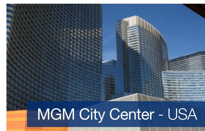
MGM City Center - USA