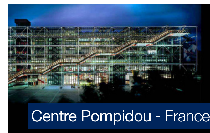
Centre Pompidou - France